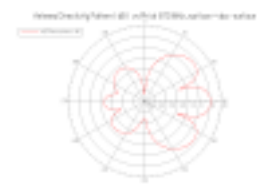
Figure 3. Radiation pattern of two patch antennas having same phase