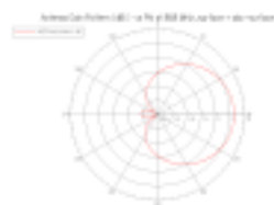
Figure 2. Radiation pattern of one patch antenna